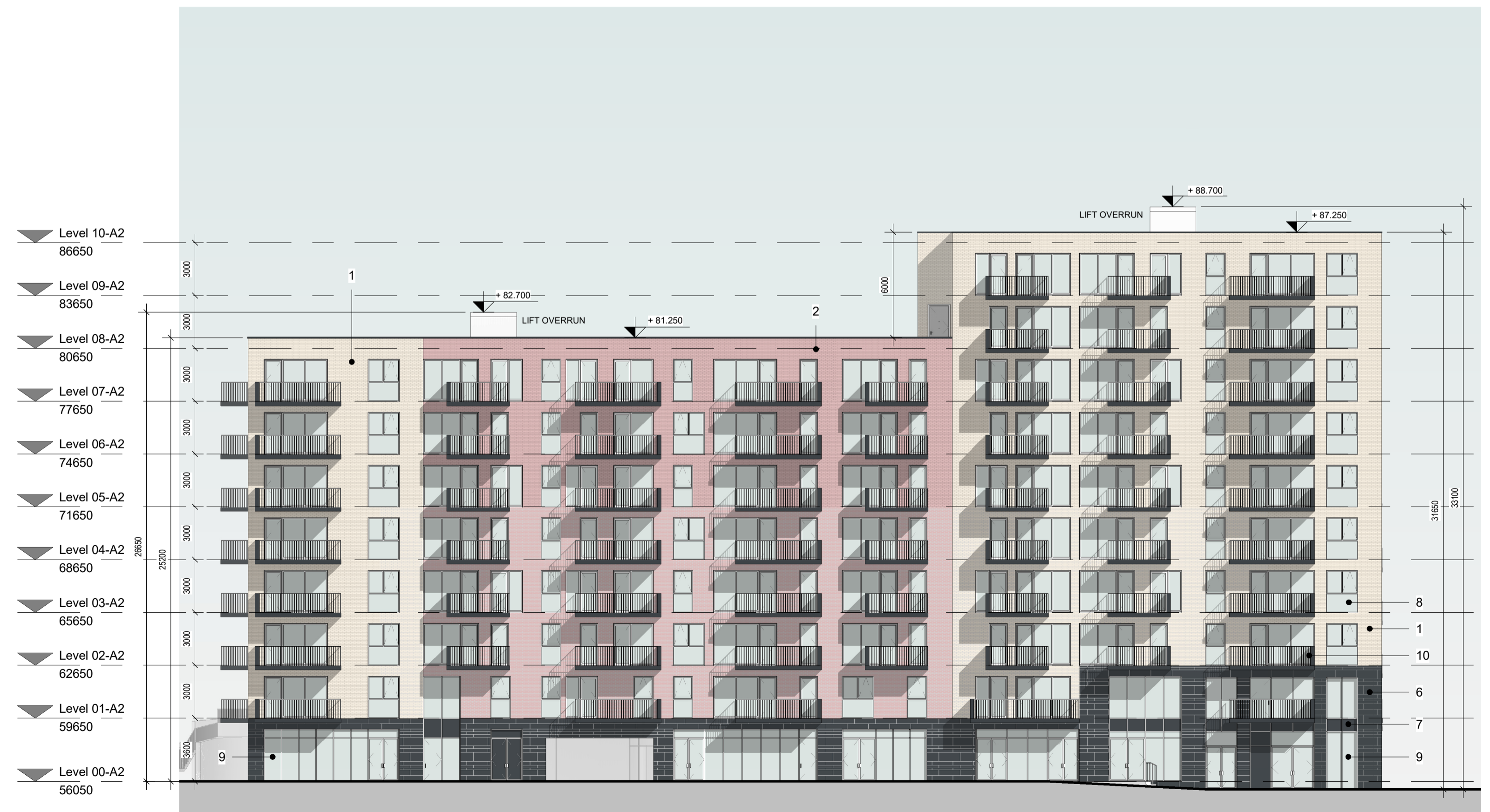
2 BLOCK A- PROPOSED WEST ELEVATION 1 : 200