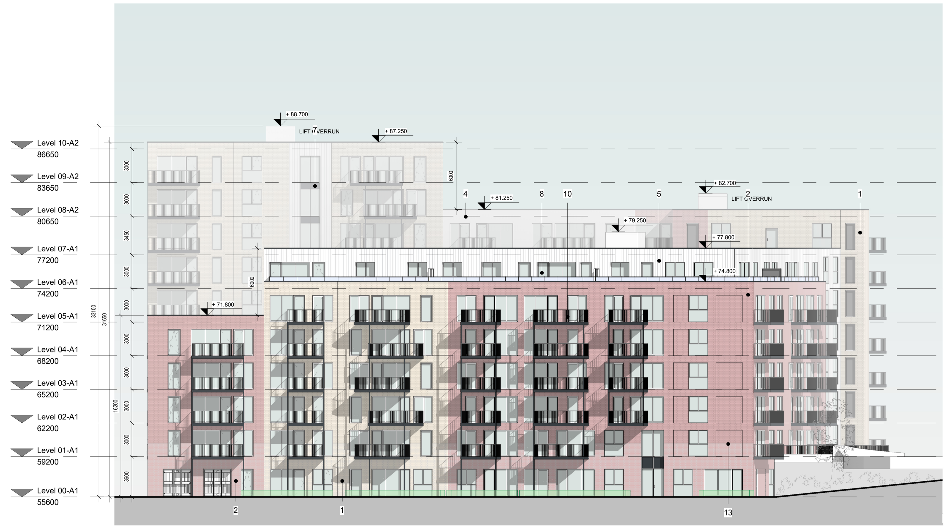
1 BLOCK A- PROPOSED EAST ELEVATION 1 : 200